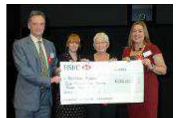
University of Aberdeen